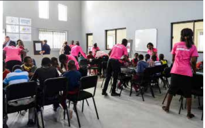
Huntington Digital Learning Campus

NEEDS: Any donations towards operating costs would be greatly appreciated