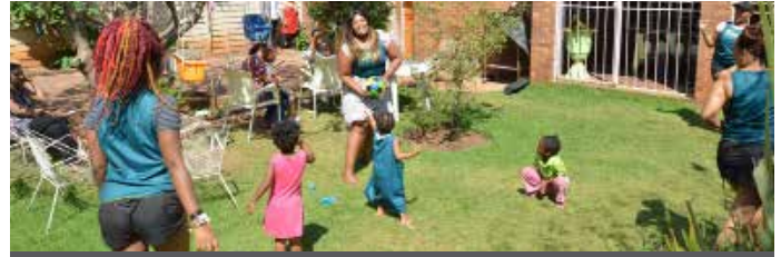
Frida Hartley Shelter

This is a MORE Family Collection staff programme, facilitated by MCF, which encourages our people to live the MORE values and give back to their local communities. They do this by lending a hand at MCF's development projects through our Get Your Hands Dirty initiatives, which sees them roll up their sleeves to help out with building, maintenance, gardening, cleaning, cooking, childcare, and any other tasks that contribute to the projects' success and communities' well-being.