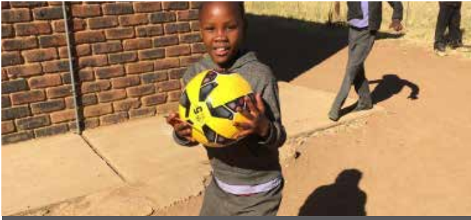
Heuningvley Primary School

In collaboration with: Marataba and Marataba Community & Conservation Foundation, Limpopo