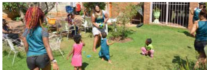
Frida Hartley Shelter

This is a MORE Family Collection staff programme, facilitated by MCF, which encourages our people to live the MORE values and give back to their local communities. They do this by lending a hand at MCF's development projects through our Get Your Hands Dirty initiatives, which sees them roll up their sleeves to help out with building, maintenance, gardening, cleaning, cooking, childcare, and any other tasks that contribute to the projects' success and communities' well-being.