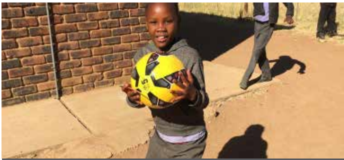
Heuningvley Primary School

In collaboration with: Marataba and Marataba Community & Conservation Foundation, Limpopo