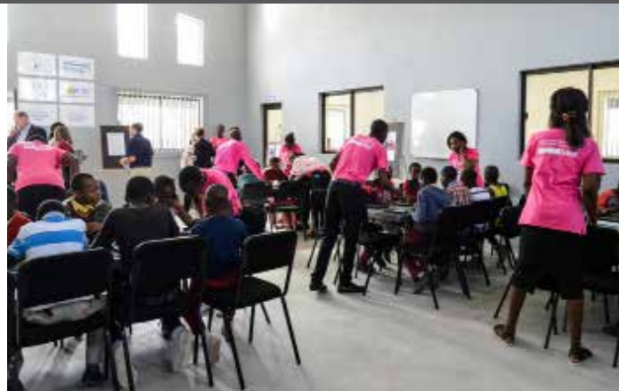
Huntington Digital Learning Campus

NEEDS: Any donations towards operating costs would be greatly appreciated